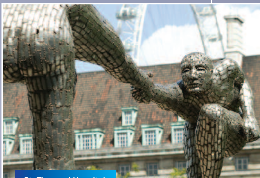
St. Thomas' Hospital